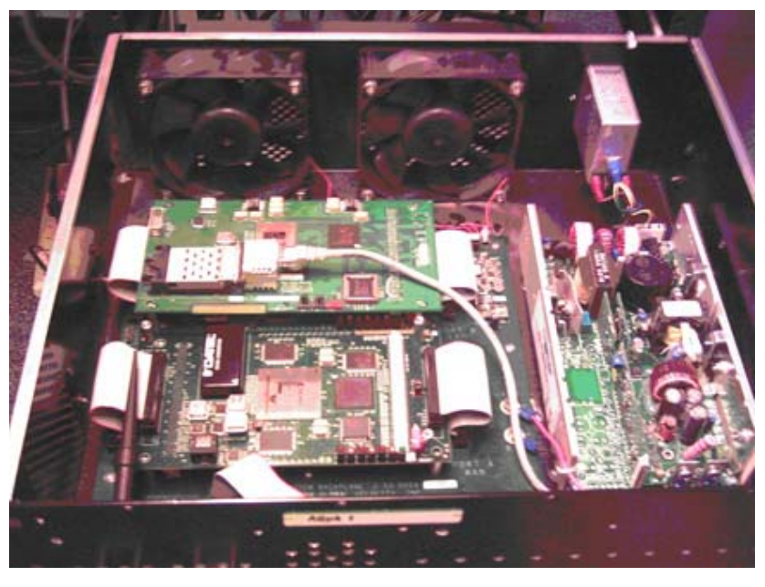
Figure 1. Experimentation Setup

A Field-programmable Port Extender (FPX) module was mounted in a 3U rack-mount chassis to evaluate how effective thermally-adaptive circuits could achieve in a realistic deployment configuration. This case was equipped with 2 fans that each supplied 250 Linear Feet per Minute (LFM) of air flow through the chassis. The system has a cover which was removed for the photo shown below in Figure 1