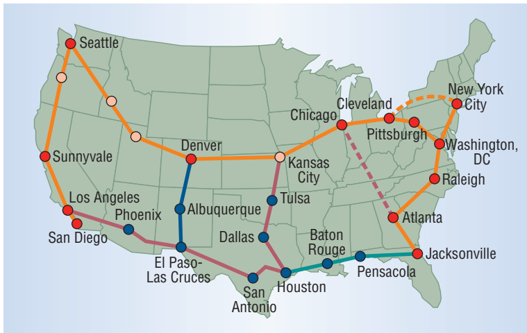
Figure 1. National LambdaRail. Using this backbone, the virtual testbed can support larger traffic volumes, with PlanetLab nodes aggregating traffic from local sites and feeding it to the backbone nodes.

that content delivery networks operate. The local representative can then translate the packets into an internal format for delivery to the server and translate the packets back to Internet format for the reply. In addition, developers can use this approach to point to multiple virtual testbeds.